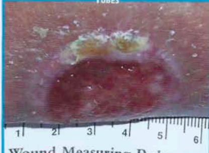
AFTER 15 DAYS USING DERMASAVER SHIN-KNEE TUBES