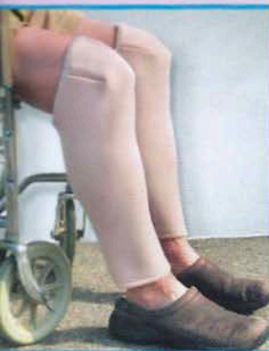
DERMASAVER SHIN-KNEE TUBE

Once we saw the DermaSaver leg protectors we wanted to try them in order for her to reach her goal. When wearing the DermaSaver product, her legs were protected and provided an opportunity to heal without any recurrent injury to them. Her legs also looked smooth and toned. During the time she has worn the DermaSaver Shin-Knee tubes the only injury she had to her one lower extremity was on her lateral thigh beyond the area covered by the DermaSaver product.