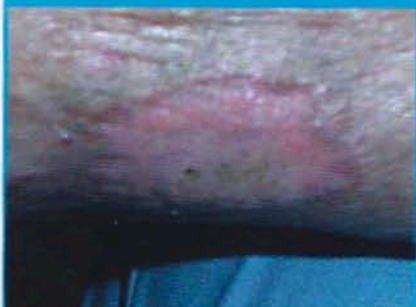
AFTER USING DERMASAVER SHIN-KNEE TUBES